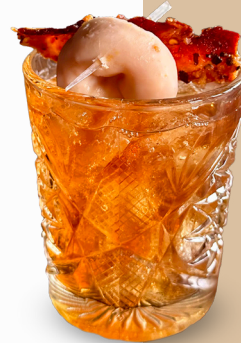
One In A Million...Aire Old Fashioned

elijah craig small batch bourbon, barrel-aged in house, orange & cherry liqueur, angostura bitters, finished with a mini donut and millionaire's bacon $13