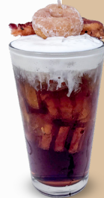
Donut Forget Dad! Soda (N/A)

root beer, vanilla monin, cold foam, finished with a mini donut and millionaire's bacon $5